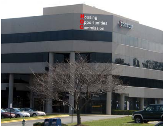
Above: HOC’s new Customer Service Center at 101 Lakeforest Blvd. in Gaithersburg, MD. The building also houses Comcast offices. HOC’s offices are on the second floor.